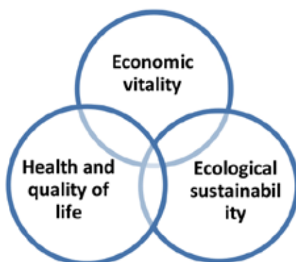
Fig 1: Sustainable development model.