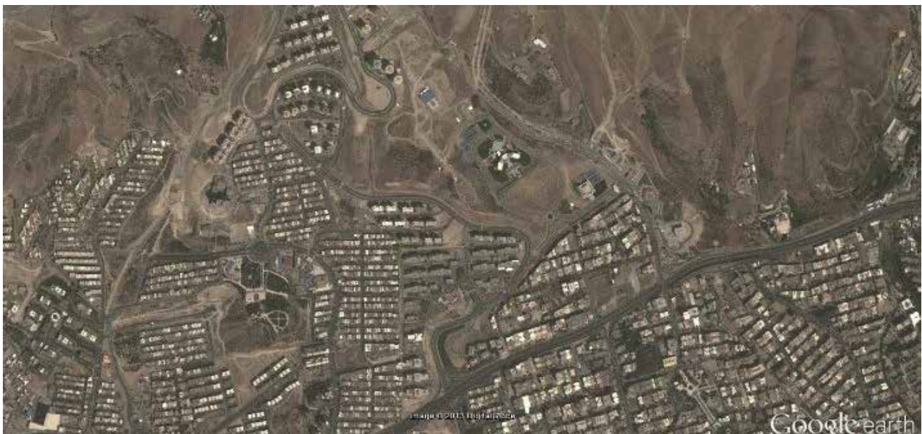
Fig 3: Regional location of Faraz.

Iranian cities have always represented development patterns during centuries which can be useful for today designer efforts. While, unfortunately, these facts have been neglected with imbalanced construction patterns and Overuse of resources which have led to destruction of environment. This paper proposes an introduction to sustainability and